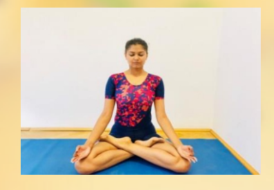
KAPALBHATI (Cleansing Process)

Kapalabhati purifies the frontal air sinuses, helps to overcome cough disorders.