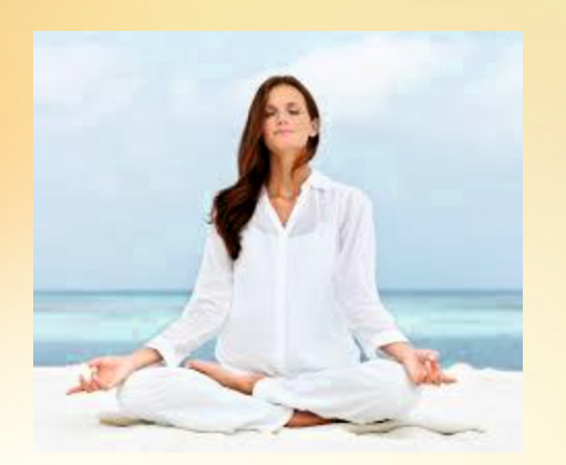
Meditation: Blue Colour Meditation

Bhastrika pranayama increases the oxygen content in the blood. Extra oxygen replenishes the entire body.